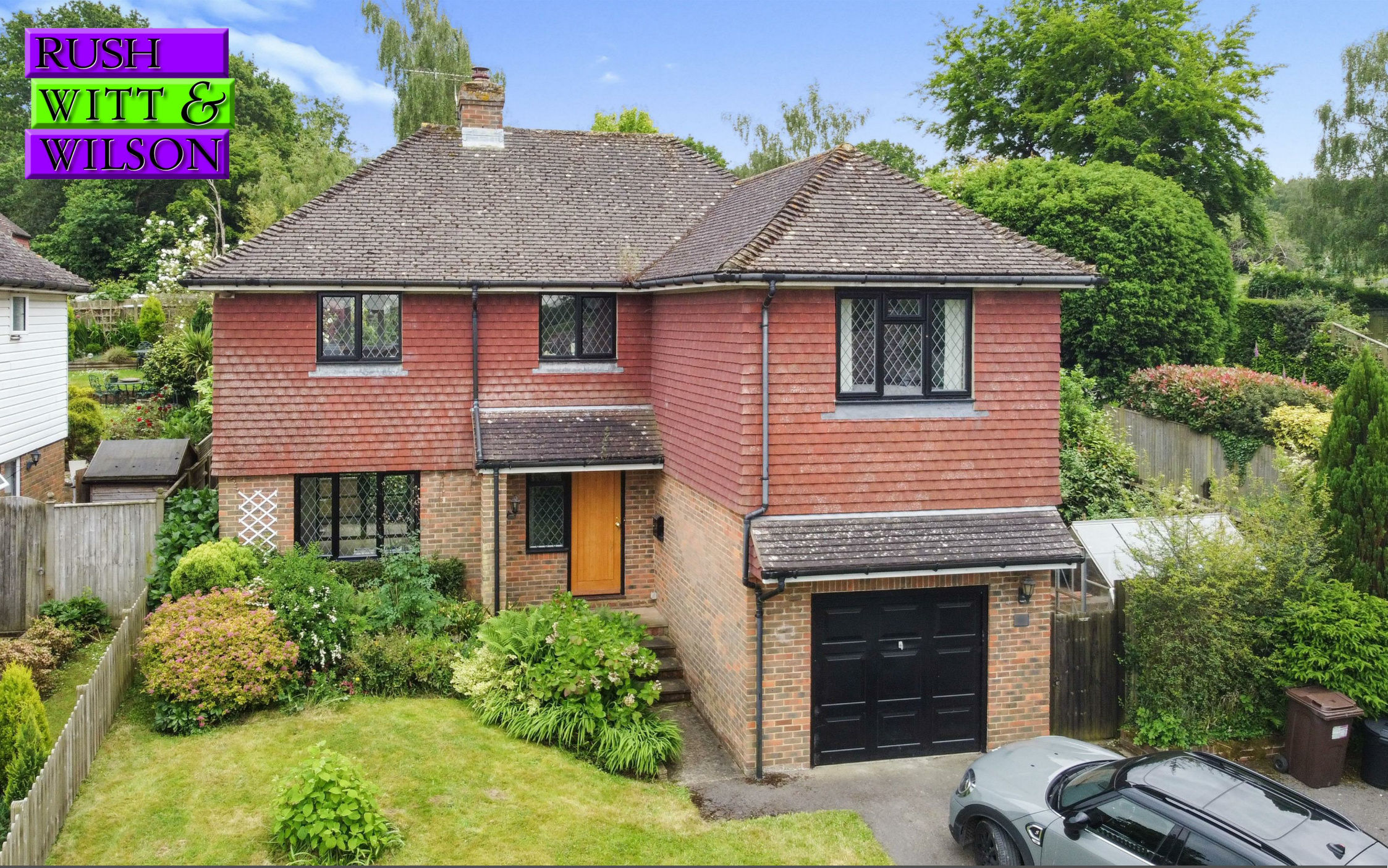
Laurels, Main Street, Beckley, East Sussex, TN31 6RR. £575,000 Freehold